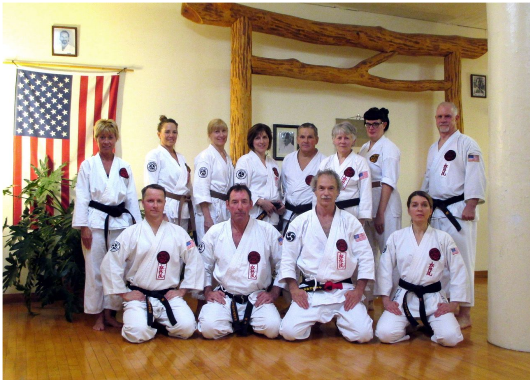
A spirited class was held before heading out to Boston's 15th anniversary work out.

out the kaia opening at the top of our entrance door. If you have been here you know what I speak of. Come see it.