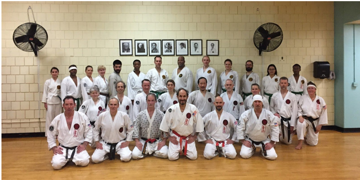
15th Anniversary workout at Boston Chinatown Ueshiro Shorin-Ryu Karate Club