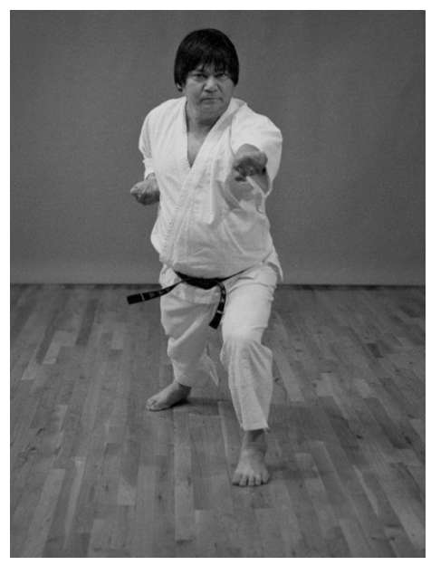
Always Moving Forward

We have also worked on new avenues to promote our dojo and Ueshiro Shorin Ryu including Class Pass, Meetup and outreach to nearby companies. In the coming months we will be hosting Open Houses for the general public and conducting workouts at outdoor venues. Kata, basics, prearranged, bunkai and weapons, are all demonstrated along with a discussion of our style of karate and the history of Shorin-Ryu.